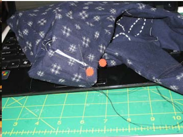
Hand stitching the folded edges closed.