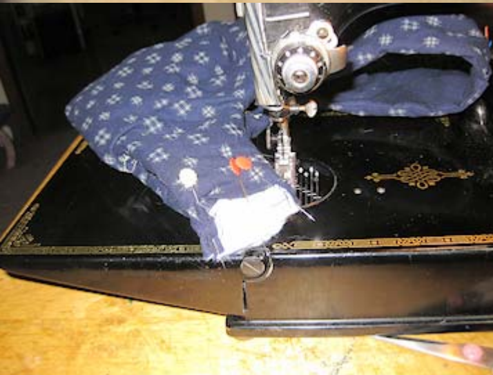
Sewing the strap top openings closed.

This is scary looking! I'm in the process of turning the bag right-side out. Don't fear! It will come out OK!