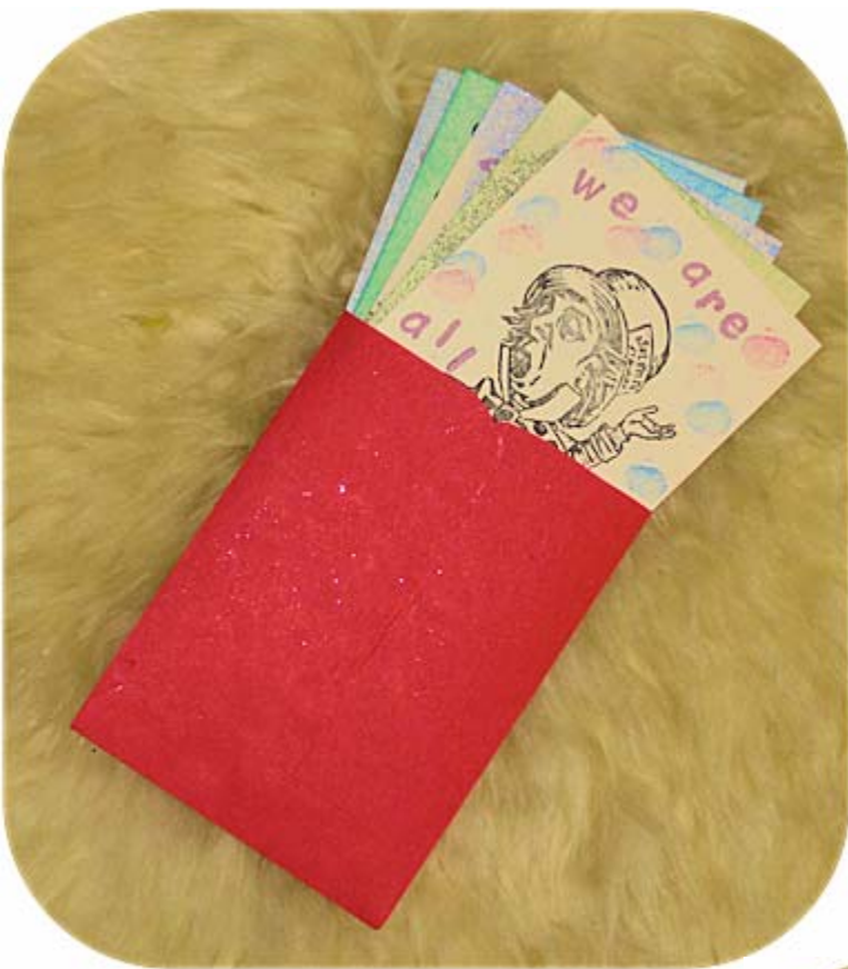
Artist Trading Cards